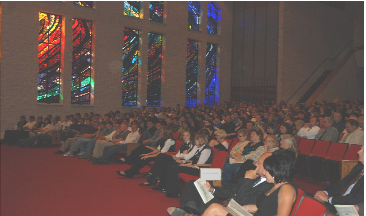
The class of 2010 at the Senior Awards Ceremony, Mt. Vernon Nazarene University Chapel.